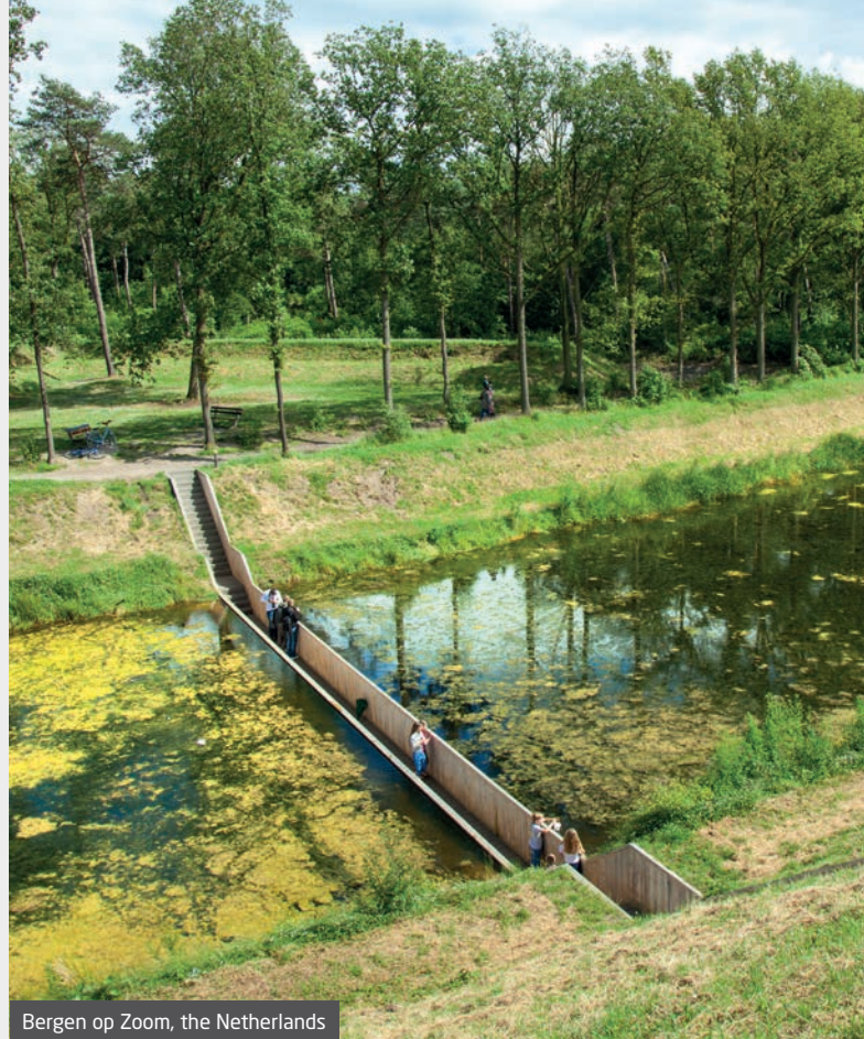
Bergen op Zoom, the Netherlands

Imagine a wood that can replace increasingly scarce tropical hardwoods, treated woods and less sustainable materials in new and existing outdoor applications. Imagine a wood that will act as a better carbon sink during its extended life span and can be safely recycled at the end. Such a wood exists. It is Accoya® wood: the world's leading high technology wood.