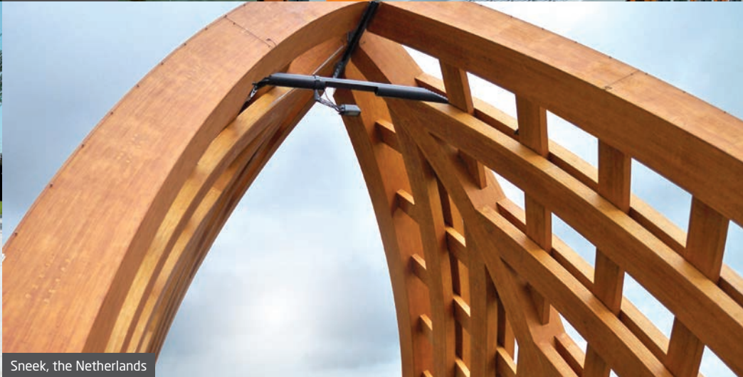
Sneek, the Netherlands